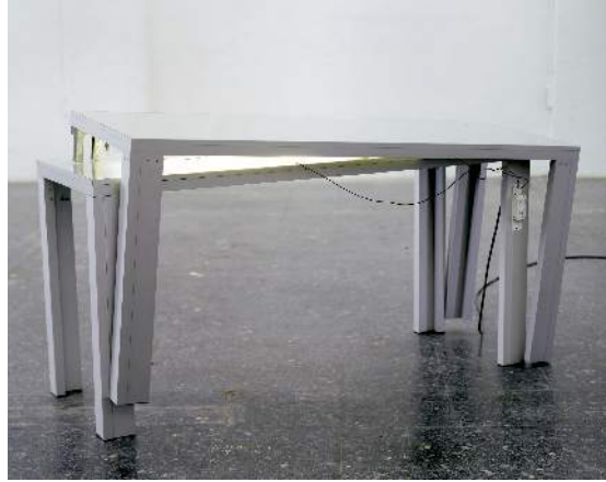
Pedro Cabrita Reis, Do You Still Love Me , 2004